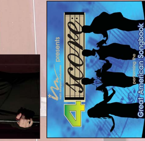
4Score is an evening not to be missed... 4Sure!