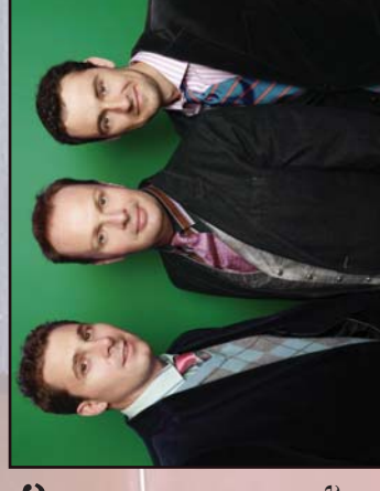
The Celtic Tenors "The best singing group I have ever heard." -- Bill Clinton, Dublin Castle 2002.

Grossmont Community Concert Association P.O. Box 249 El Cajon, CA 92022-0249 www.gccaweb.org