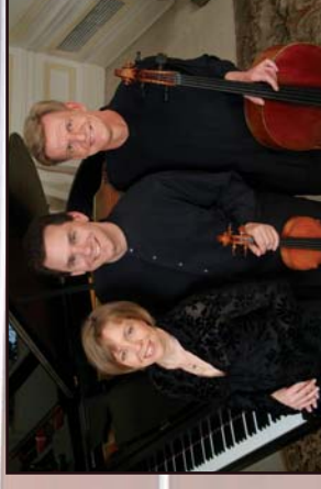
Trio Excelsior! "... incredibly moving..."