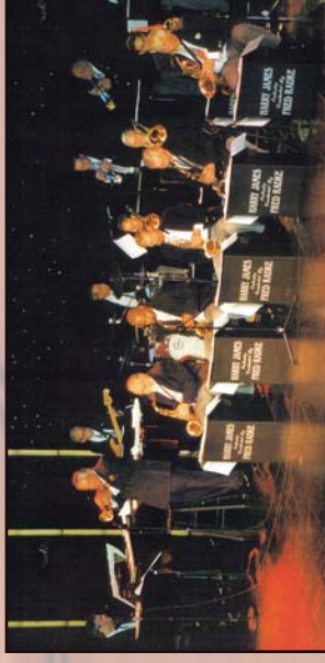
Harry James Orchestra "... flawless performances..." -- The Des Moines Register